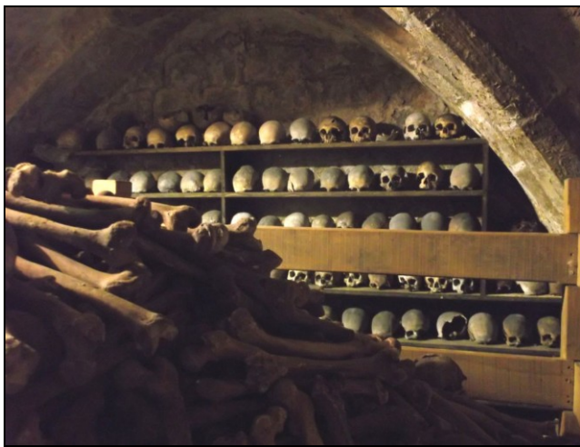
Above: Bone stacks and skulls in the crypt at Rothwell

The ultimate aim is to generate a greater understanding of the bones and also to ensure their long-term survival, as conditions in the crypt are not ideal, damp is a problem, and bones within the stacks are being crushed by the weight of the overlying bones.