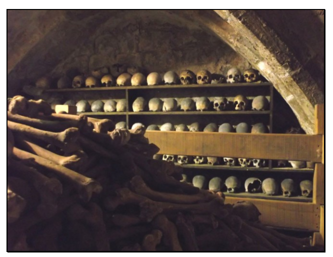
Above: Bone stacks and skulls in the crypt at Rothwell

The ultimate aim is to generate a greater understanding of the bones and also to ensure their long-term survival, as conditions in the crypt are not ideal, damp is a problem, and bones within the stacks are being crushed by the weight of the overlying bones.